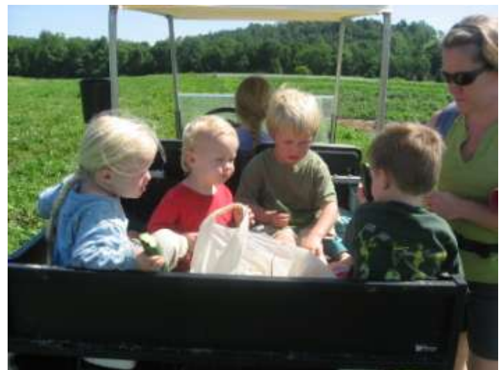
Kids enjoying field fresh zucchini and Cucumbers!!!